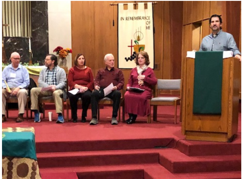
WGCC Board Members deliver a report to the congregation on Oct. 8.