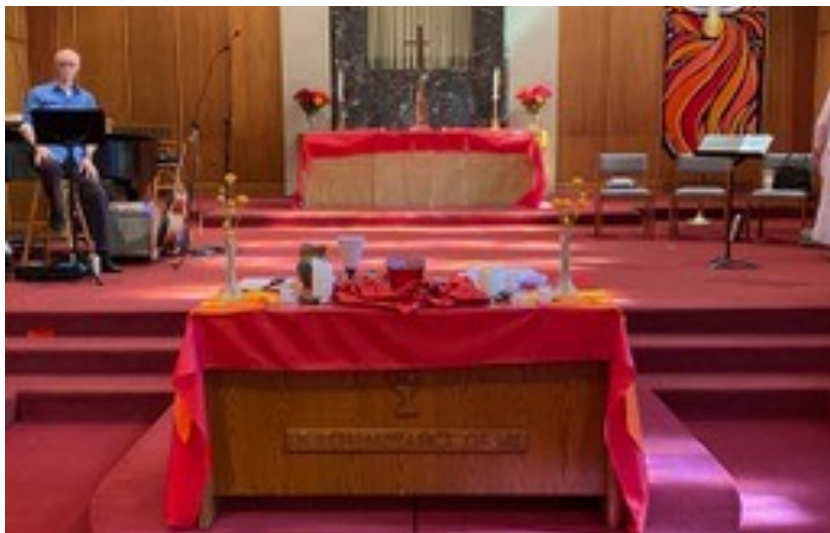
May 28: All were welcome as WGCC celebrated Pentecost.