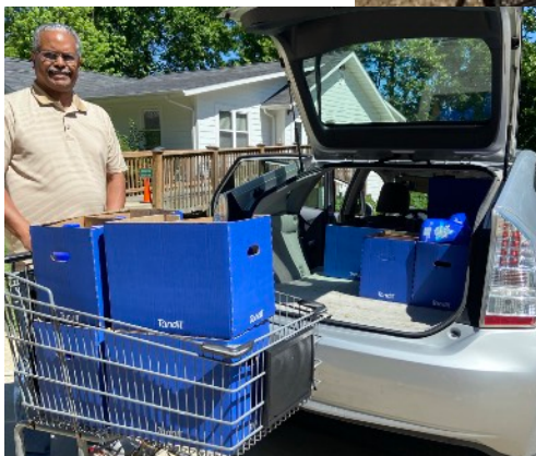
Above: The Tabitha Group toasts at Hacienda. Left: Some of the $275 donated for detergent is delivered to Webster-Rock Hill Ministries.