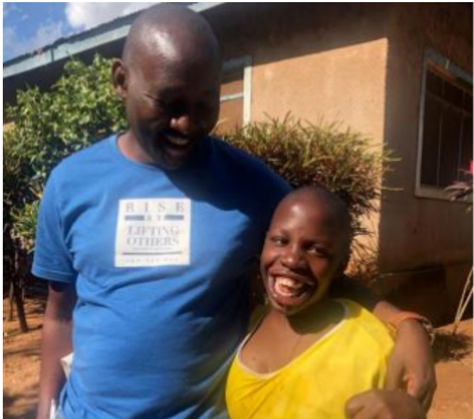
A staff member with a resident at the Tanzanian girls' orphanage.

transportation costs and provide more investment to support the other needs of the girls living at the center