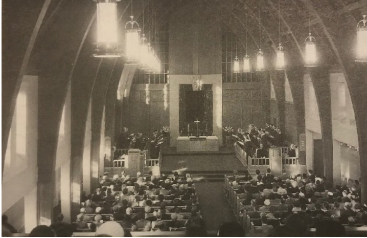
The first worship service in the new sanctuary on Dec. 19, 1954.

Please join Webster Groves Christian Church throughout the 2020 year as we celebrate our 125th anniversary by remembering what has made us the strong community that we are today, and furthermore, what will make us even stronger in the future.