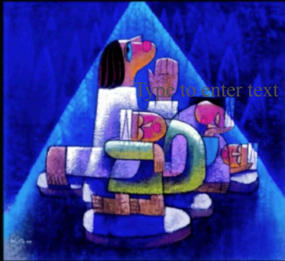
Praying at Gethsemane James He Qi